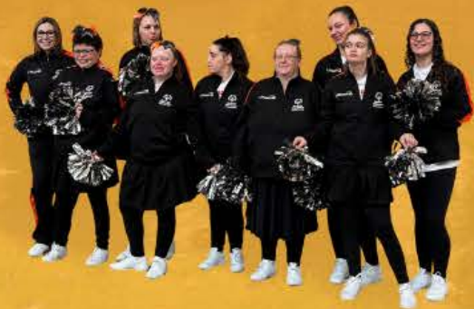
Lifeworks Social & Recreational Cheer Team

Please consider making a gift today. Together, we're building a future full of opportunity and belonging.